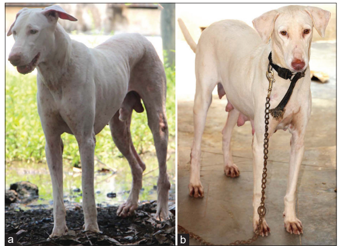
Figure 1: The Rajapalayam dog. (a) Male and (b) Female.

Twelve Rajapalayam dogs (Rajapalayam breed, C. lupus familiaris ; eight sexually mature female dogs and four sexually mature male dogs), 2–5 years old, were used [Figure 1]. The animals were maintained indoor in individual cages under a lighting schedule of 12 h L/D cycle. All the investigations (sample collection and behavioral observations) were carried out at Provokennel, a private Rajapalayam breeds breeding center, as well as at a pet store in Rajapalayam (9°27'0N and 77°33'0E) located at an altitude of MSL + 175 m], Virudunagar