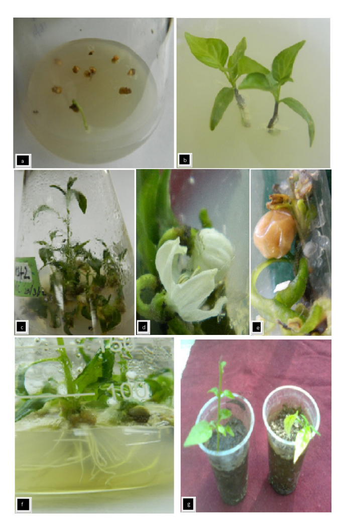
Figure 1: In vitro propagation of C. chinense variety Lota Bhot (a) Seed explant (b) Shoot tip explant (c) Multiple shoot induction (d) Flower Induction (e) Fruit Formation (f) Root induction (e) Ex vitro acclimatization (Soil + vermicompost in 1:1 ratio).

the regeneration percentage dropped down to 50% when both AgNO<sub>3</sub> and glutamine were taken out of the medium.