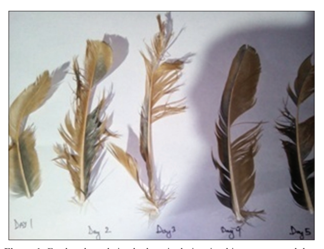
Figure 1: Feather degradation by keratinolytic microbiome on several days

soil with a relative activity of degradation was mostly Gram-positive and belongs to Bacillus. The multicellular eukaryotes like fungi may be present and needs certain morphological, biochemical analysis, and 18 srRNA sequencing for the exact identification.