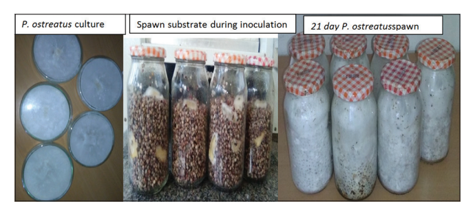
Figure 1: Pleurotus ostreatus (Jacq. ex Fr.) P. Kummer culture and spawn.

Sorghum is a suitable substrate for the production of oyster mushroom as it was reported so far. Spawn substrate composed of 94% sorghum, 5% wheat bran, and 1% gypsum and had moisture content ranging between 50% and 60% and incubated at room temperature was taken 21 days for complete mycelial colonization of as indicated hereunder in Figure 1.