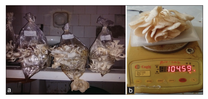
Figure 5: Mature mushroom in mushroom growing shelf and ready for harvesting (a) and weighing of harvested mushroom (b).

three consecutive flushes but more than 3 times in some substrates. Mean weight of mature mushrooms harvested vary among different substrates and per flushes. Yield per flush and substrates showed statistically significant variations in all flushes at P \le 0.05 . The highest mean weight of mature mushrooms was obtained from the Cw substrate that is 318 g and followed by Sb and Cw50:Sb25:Sd25 which provide 300 and 271 g of mean weight of mature mushroom, respectively, and the least mean weight of mature mushroom is obtained from Sd which is 24 g which all are recorded in the first flush as indicated in Table 2 and Figure 5.