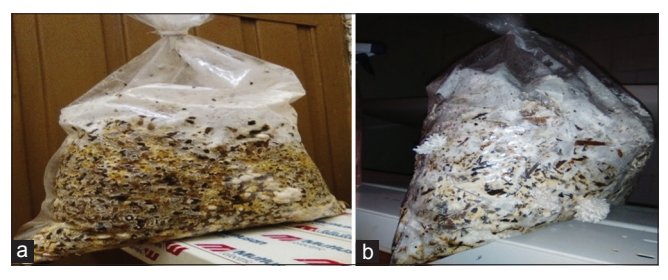
Figure 3: (a and b) Pinhead formation.

Matured mushrooms were harvested by hand picking and scissor without harming the substrate. Mature mushrooms were harvested for