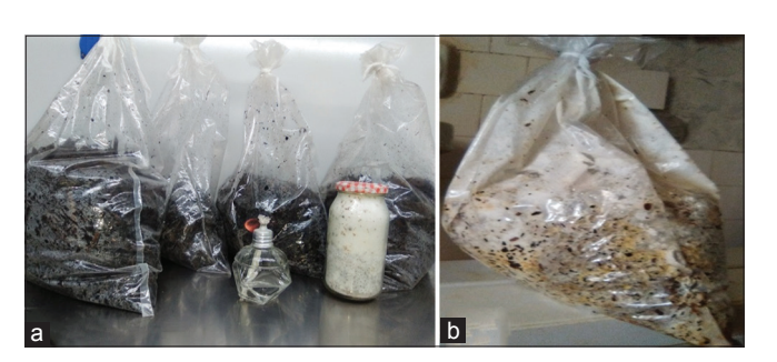
Figure 2: Spawning of sterilized substrates (a) complete mycelial colonization (b).